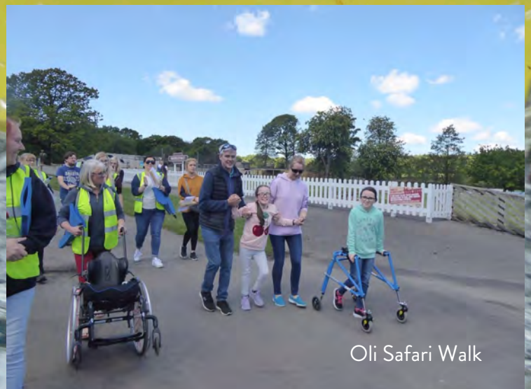
Oli Safari Walk