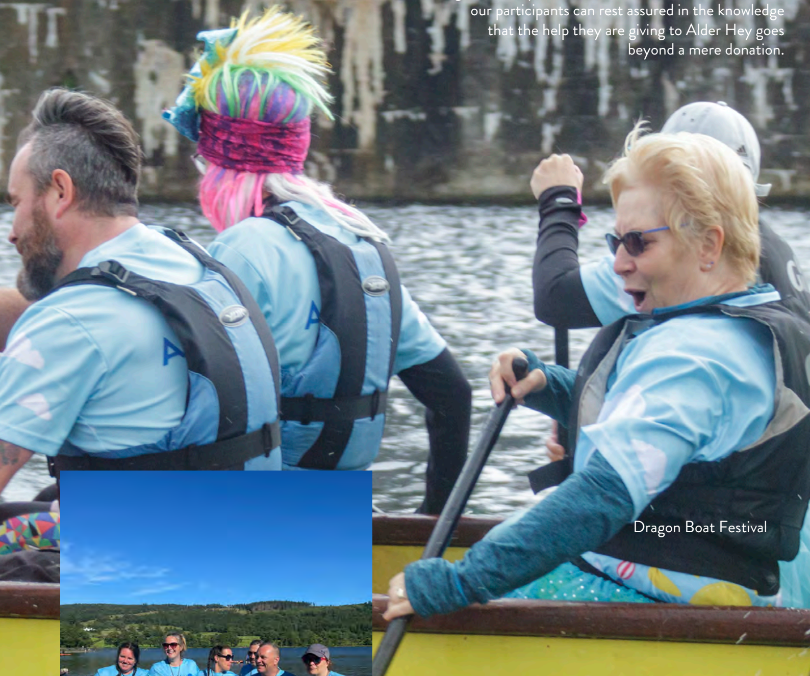
Dragon Boat Festival

With a huge sense of personal achievement and satisfaction all our participants can rest assured in the knowledge that the help they are giving to Alder Hey goes beyond a mere donation.